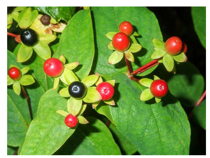
to spray the larger infestations as well as to Photo: Tutsan - Mature berries are black purchase some hand tools and chemical to support our efforts.

We have now been successful at getting the Maple fairly well controlled and we have now also started on another weed (Tutsan) that is established at the site. Tutsan ( Hypericum androsaemumis ) is a perennial shrub that grows to about 1.5m tall, it is related to St John's Wort and is noted as being a serious threat to damp and wet schlerophyll forests. We have received a Communities for Nature grant to assist our efforts that will be used to fund contractors to spray the larger infestations as well as to