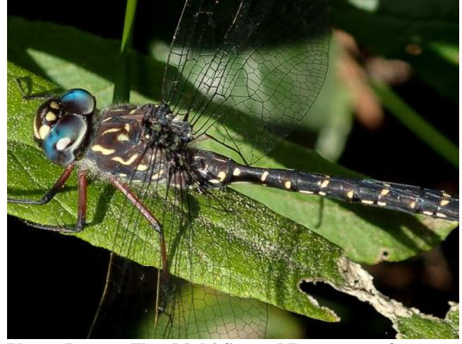
Photo: Dragon Fly - Multi Spotted Darner, not far from the Suspension Bridge - March 2015

Photo Gallery – Images from around the Park (Includes posts from Facebook Page)