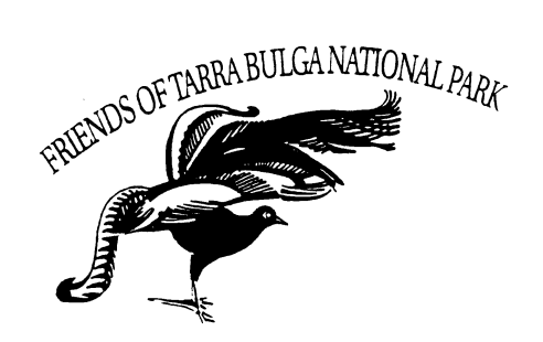
Incorporation number A0031385X