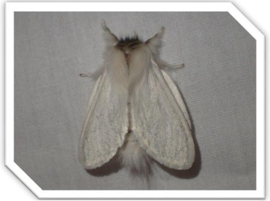
FIGURE 4: TRICHIOCERCUS SPARSHALLI