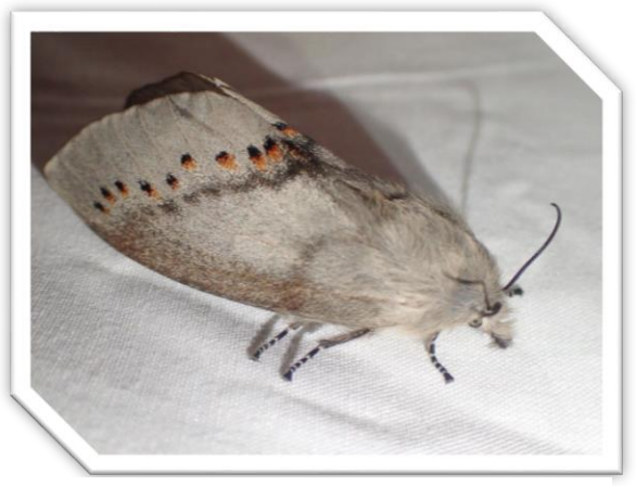
FIGURE 2: PINARA SP.