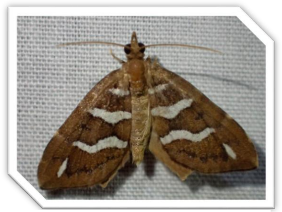
FIGURE 3 CHAETOLOPHA NIPHOSTICHA