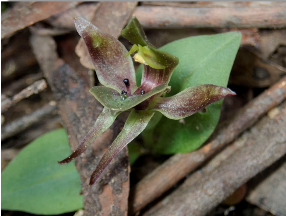
II BIRD ORCHID - DIAPER TRACK OCT 2017