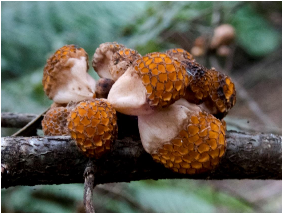
VIII - BEECH ORANGE FUNGUS - OCTOBER 2017 DIAPER TK