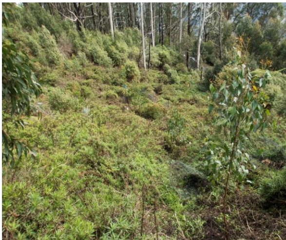
III GRAND RIDGE RD REVEGETATION SITE AUGUST 2017

Since our last newsletter we have had small working bees in several of our ongoing project sites within the park. It is enjoyable to keep re-visiting these areas and seeing the progress being made. Activities have included removing tree guards from successfully established trees on Diaper Track and along the Grand Ridge Rd as well as weeding for Sycamore Maple and Tutsan in the Tarra Valley. Thanks to everyone who has made it along this year you help is truly valued.